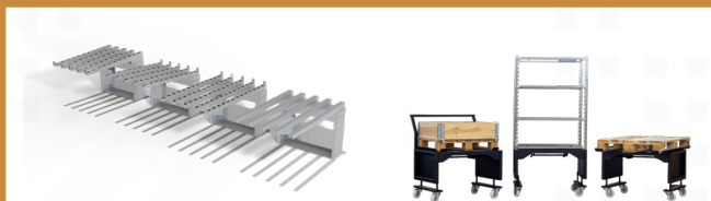
Gates & Shelf Cart