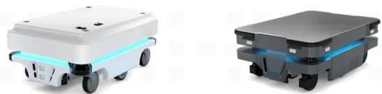
MiR100 & MiR250