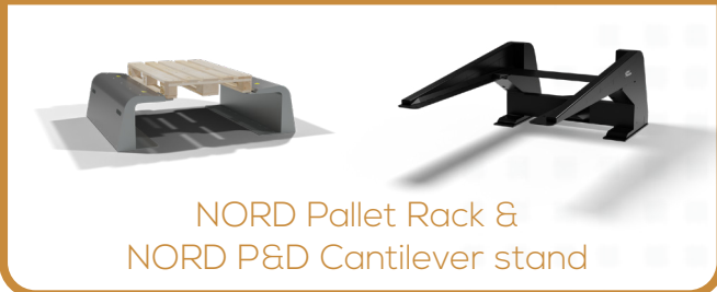
NORD Pallet Rack & NORD P&D Cantilever stand