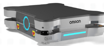
OMRON MD-650 & MD-900