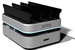
NORD QM140 V1 - OTTO 100