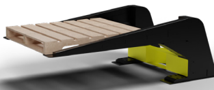
NORD P&D Stand Cantilever 1200 V1 - OTTO 1500