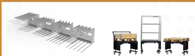
Gates & Shelf Cart